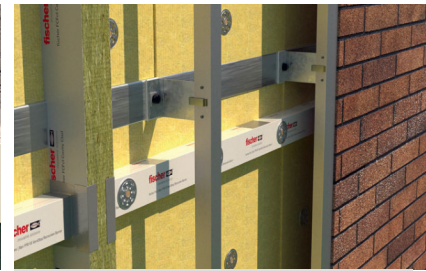
FFB-VS VentiStop installed with DHM Anchor