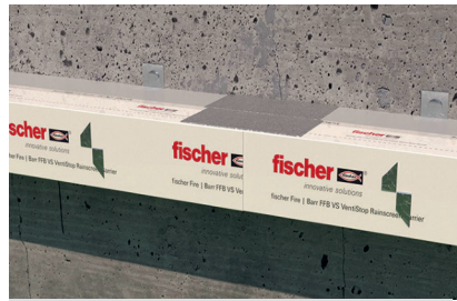
FFB-VS VentiStop installed with Multi-Purpose Bracket